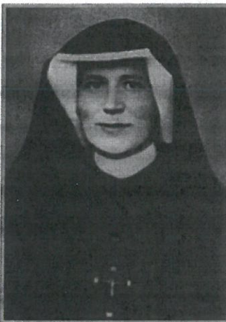
Photograph of St. Faustina